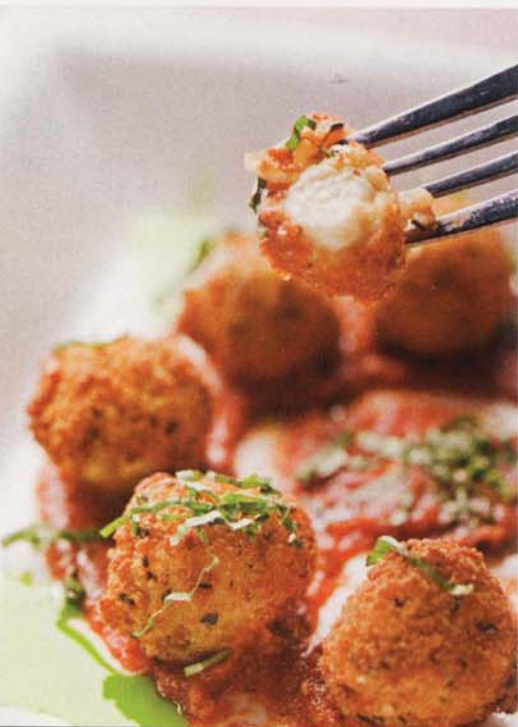
Above right: Diver scallops are simply sauced with brown butter and pancetta. Above: Pan-fried mozzarella balls take the standard appetizer to a higher plane.